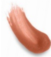
Brown Sugar #7873